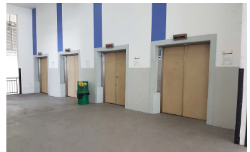
Lift lobby at loading bay