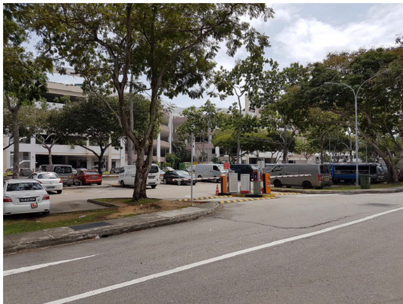
Entrance to HDB car park managed by Wilson Parking $1.20 per hour